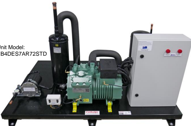
Unit Model: EB4DES7AR72STD